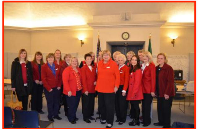
EPRWC and LRW ladies representing Pierce County.