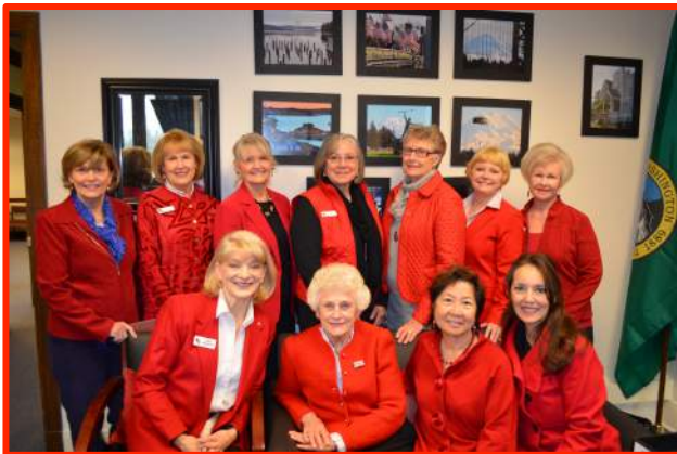
LRW ladies in Senator O'Ban's office.