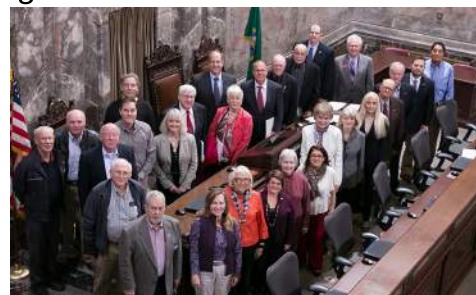
28 th District PCO's at the Capitol w/Senator O'Ban & Representative Muri.